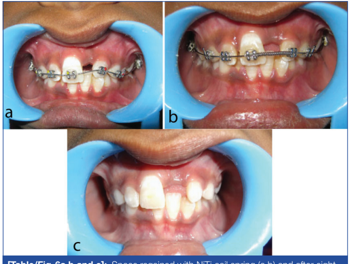
[Table/Fig-6a,b and c]: Space regained with NiTi coil spring (a,b) and after eight veeks space regained for placement of denture tooth (c).

In the next phase, fixed orthodontic treatment was started on maxillary arch to create adequate space for the prosthetic replacement of central incisor. Initial alignment and leveling was achieved with super elastic 0.016 inch Nickel-Titanium (NiTi) wire. Bands were placed on the upper first molars, and orthodontic brackets were limited to the three permanent anterior teeth and two primary canines. Compressed nickel-titanium open coil spring 2-3 mm longer than the space required between left maxillary lateral incisor and right maxillary central incisor was inserted in order to open the required space for the replacement of missing tooth and to maintain the space for the future bridge or implant placement once the growth ceases [Table/Fig-6a-c].