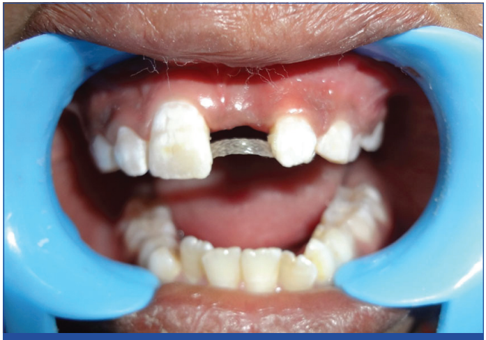
[Table/Fig-7]: Ribbond fibre strip placed on palatal surface of teeth 11 and 22

USA) fiber strip was cut (predetermined by dental floss) using special scissors [Table/Fig-7]. The palatal surface of teeth 11 and 22 were prepared to receive the Ribbond (Ribbond, USA). As a pontic, prefabricated acrylic denture tooth was prepared by making undercut lingual groove and bonded in place with composite. Occlusion was adjusted and polished [Table/Fig-8]. The child and the parents were instructed to not to bite hard food and objects from the temporary tooth and the bridge will help in only in aesthetics and phonation. Regular follow-up for every six months was advised.