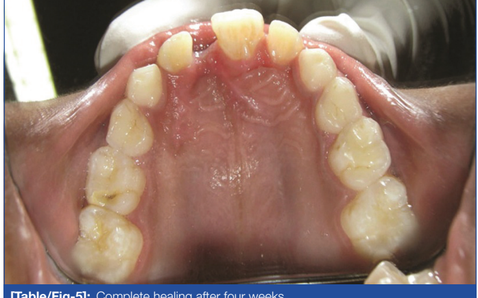
[Table/Fig-5]: Complete healing after four weeks

In the next phase, fixed orthodontic treatment was started on maxillary arch to create adequate space for the prosthetic replacement of central incisor. Initial alignment and leveling was achieved with super elastic 0.016 inch Nickel-Titanium (NiTi) wire. Bands were placed on the upper first molars, and orthodontic brackets were limited to the three permanent anterior teeth and two primary canines. Compressed nickel-titanium open coil spring 2-3 mm longer than the space required between left maxillary lateral incisor and right maxillary central incisor was inserted in order to open the required space for the replacement of missing tooth and to maintain the space for the future bridge or implant placement once the growth ceases [Table/Fig-6a-c].