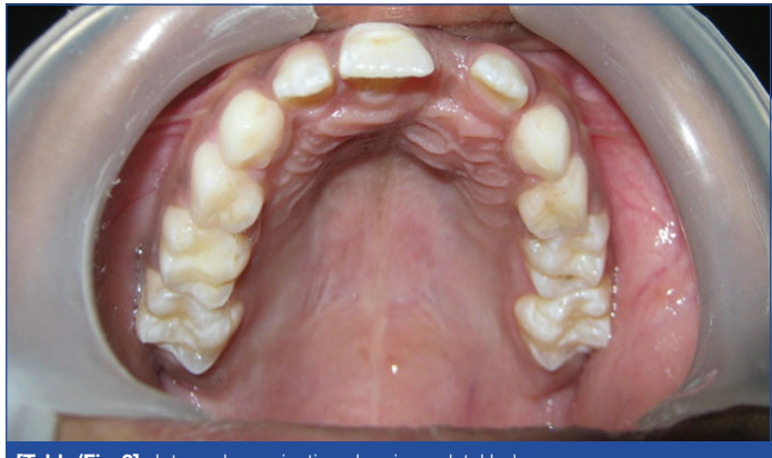
[Table/Fig-2]: Intraoral examination showing palatal bulge

The intraoral clinical examination revealed healthy mixed dentition with well formed labial mucosa and missing tooth number 21 with bulge on the palatal mucosa of 21 [Table/Fig-2]. Sagittal section of Cone Beam Computed Tomography (CBCT) revealed that the impacted tooth was located palatally close to palatal cortical bone, palatal angulation and dilacerated at cementoenamel junction [Table/Fig-3a,b].